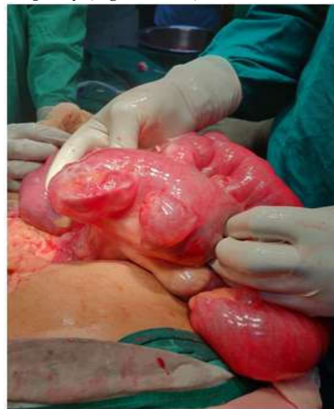
Fig. 2: Small intestine diverticula

Surgical findings were Multiple small intestine diverticula with pnuematocoeles which presented as primary peritonitis and stricture at terminal ileum which was repaired with transverse ileoplasty (Figs. 2 and 3).